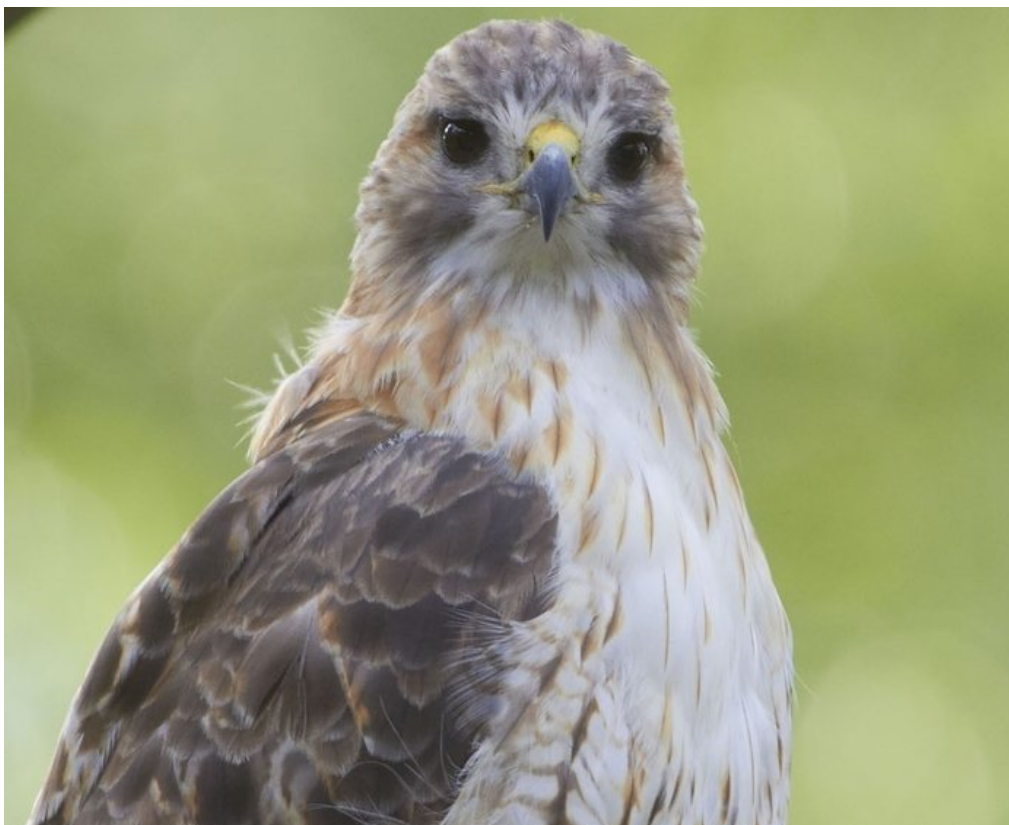
Photo of Pale Male in Central Park taken by Lincoln Karim on September 16, 2011 (palemale.com)

PETITION SUBMITTED UNDER THE ADMINISTRATIVE PROCEDURE ACT TO AMEND FEDERAL REGULATIONS AND EFFECTUATE THE GOALS OF THE MIGRATORY BIRD TREATY ACT BEFORE THE SECRETARY OF THE UNITED STATES DEPARTMENT OF INTERIOR